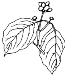
White Flowering Dogwood