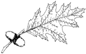
Northern Red Oak