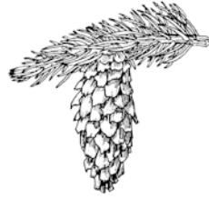
Colorado Blue Spruce